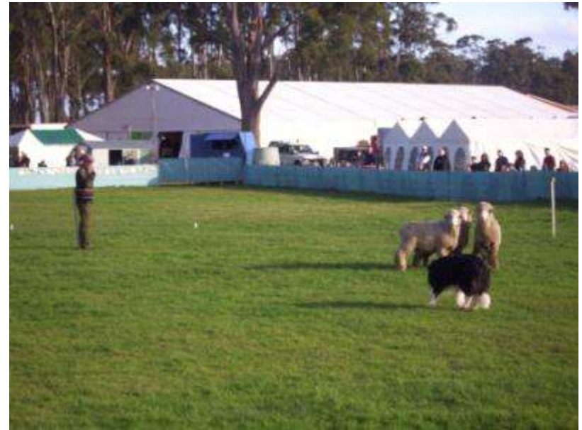
The Sheep dog trials