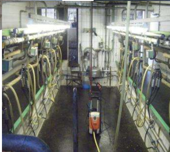
These pictures are of Anika's neighbours farm.