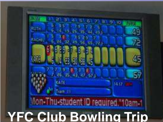
YFC Club Bowling Trip