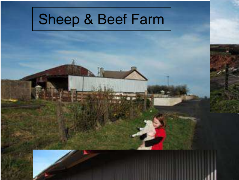
Sheep & Beef Farm