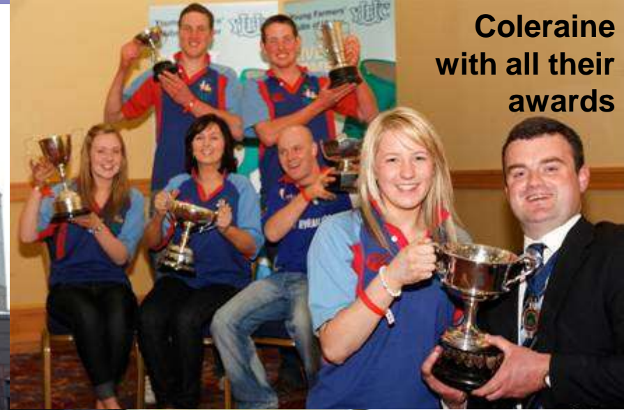
Coleraine with all their awards