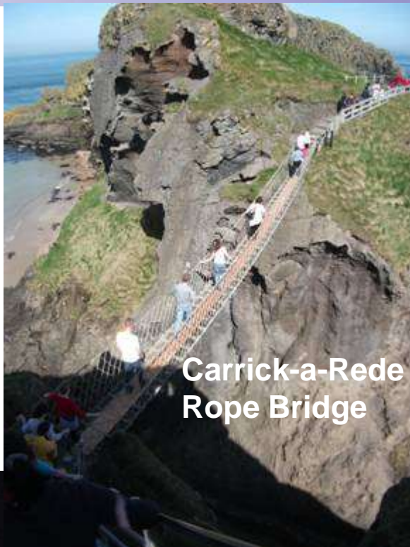
Carrick-a-Rede Rope Bridge