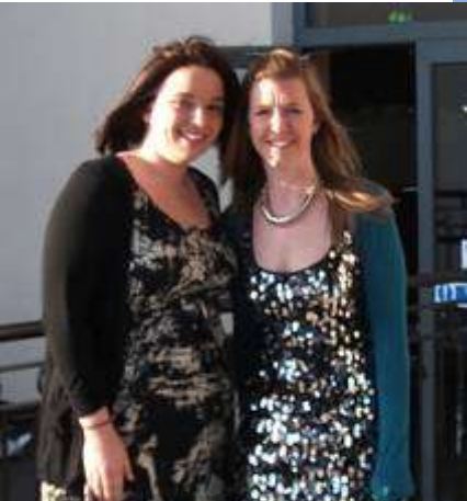
City Armagh Hotel