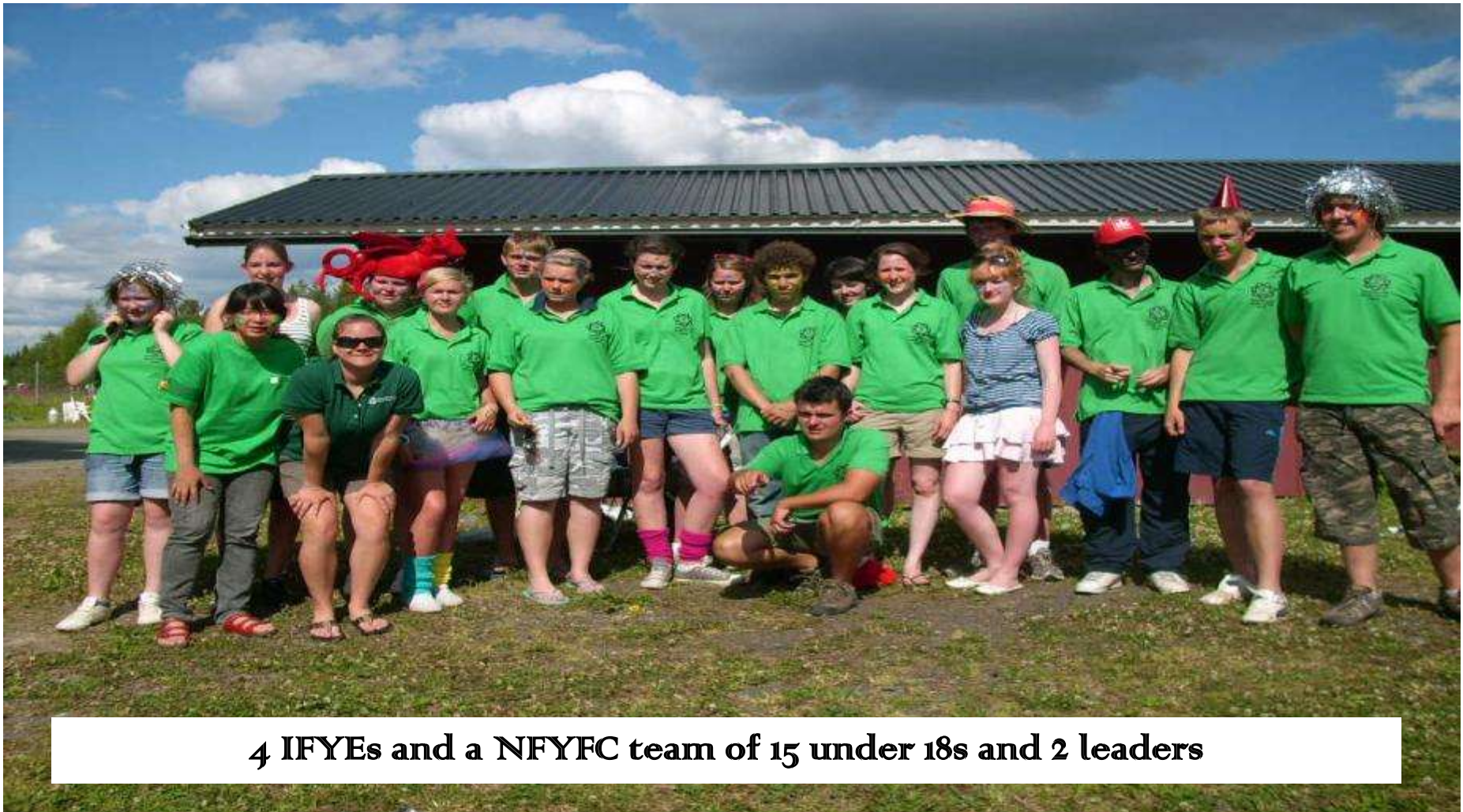
4 IFYEs and a NFYFC team of 15 under 18s and 2 leaders