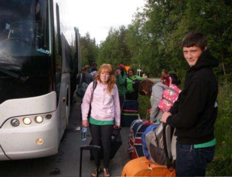
The Arrival at Camp!