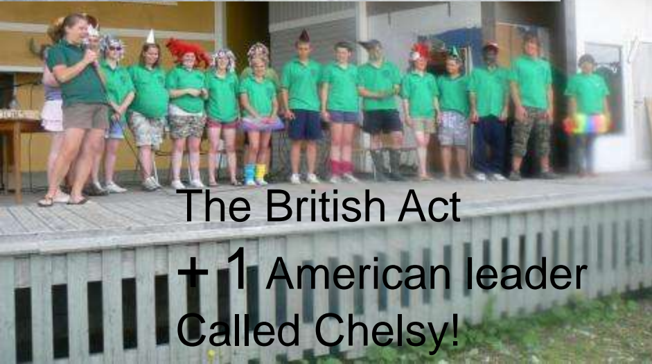
The British Act + 1 American leader Called Chelsy!