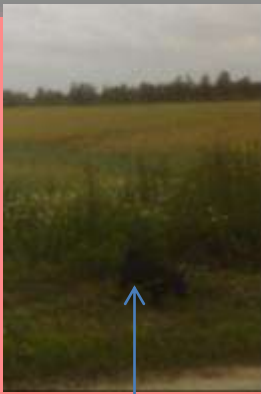
Hockey the terrier