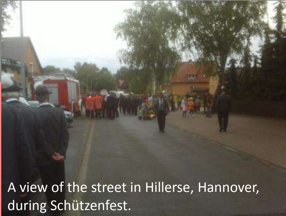
A view of the street in Hillerse, Hannover, during Schützenfest.

A German tradition involving shooting, marching and drinking!