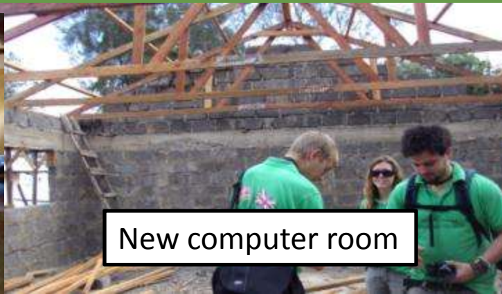
New computer room