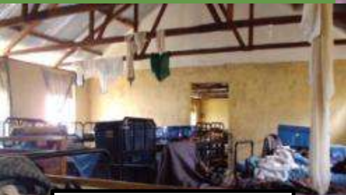
Boys boarding bedroom