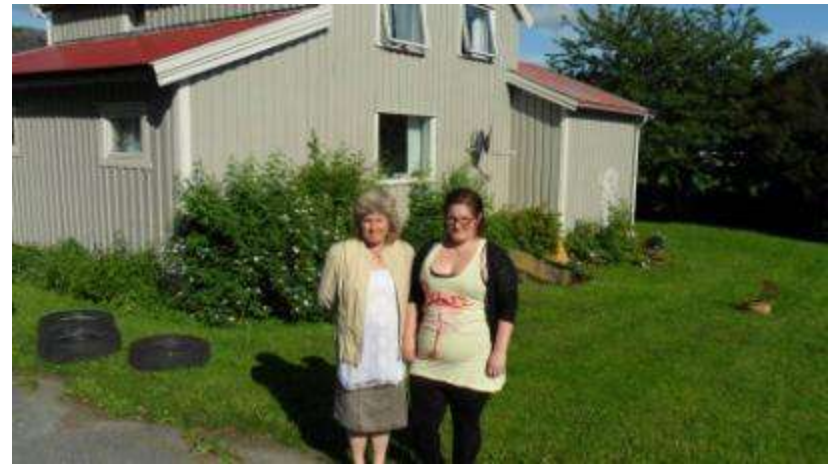
My first host Family